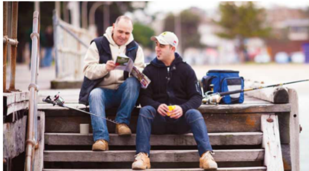
(a) 2013 p.1

Turn over to see your account balance estimate at age 67 and what annual income this could provide.